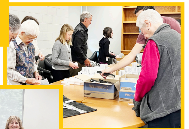
Photographs of just some of the 60 people (between the ages of 3 and 97) that helped with the God's Work. Our Hands. service project.