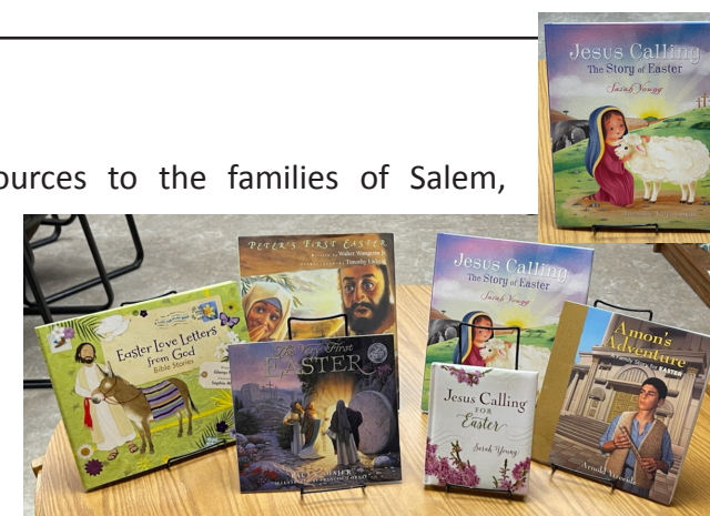
TOP: Book purchased for Salem Lutheran Preschool BOTTOM: Books purchased for the youth of Sunday School

The focus for the children's library will remain to facilitate and support the faith formation of families.