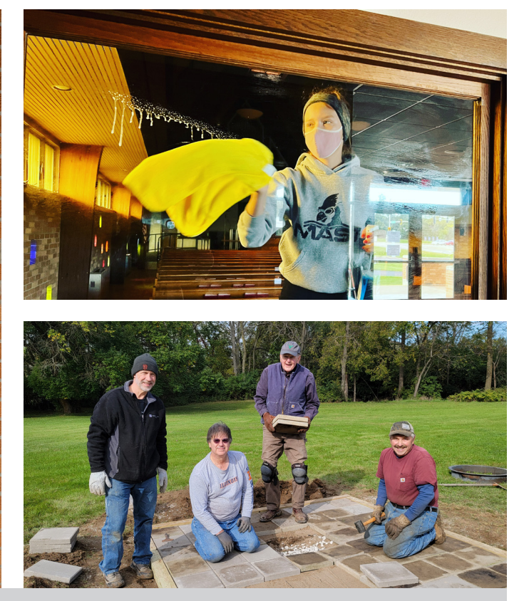
Thank you to those who helped organize and complete tasks during Work Day in October.