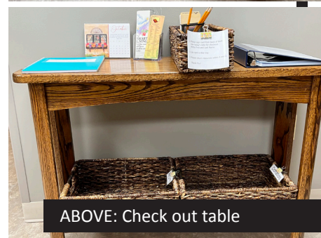
ABOVE: Check out table