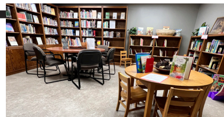
ABOVE: Salem Library

*Donations of books are welcome to enhance the Growing People in Christ... to Love and Serve with the understanding that they may or may not be added to the collection based on library's guidelines-Salem's mission, condition and limited space. Any books not used will be donated to a local agency.