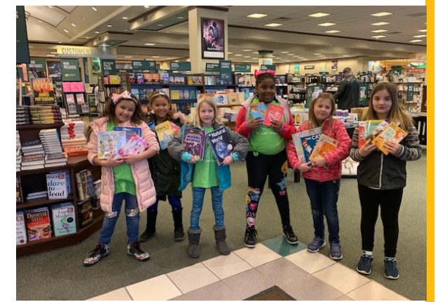
ABOVE: Second and third grade children at Be Like Jesus select books for the Look. It's My Book! program.