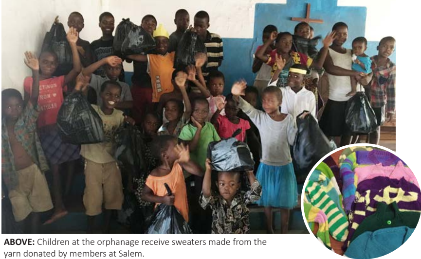
ABOVE: Children at the orphanage receive sweaters made from the yarn donated by members at Salem.