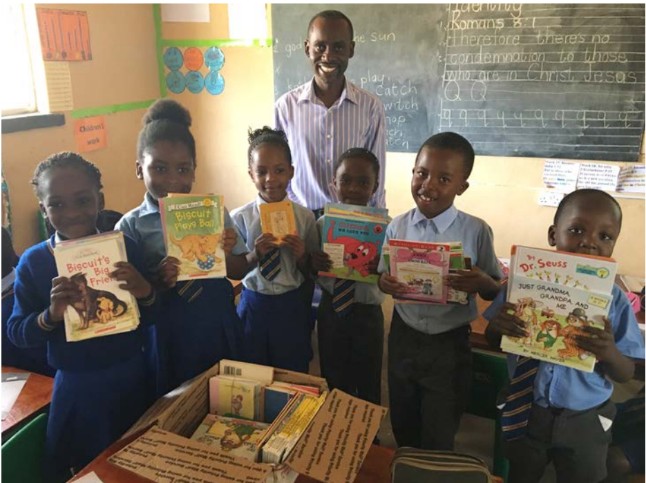
ABOVE: Salem in the fall sent books to Mawali, the students at the orphanage added these to their library.